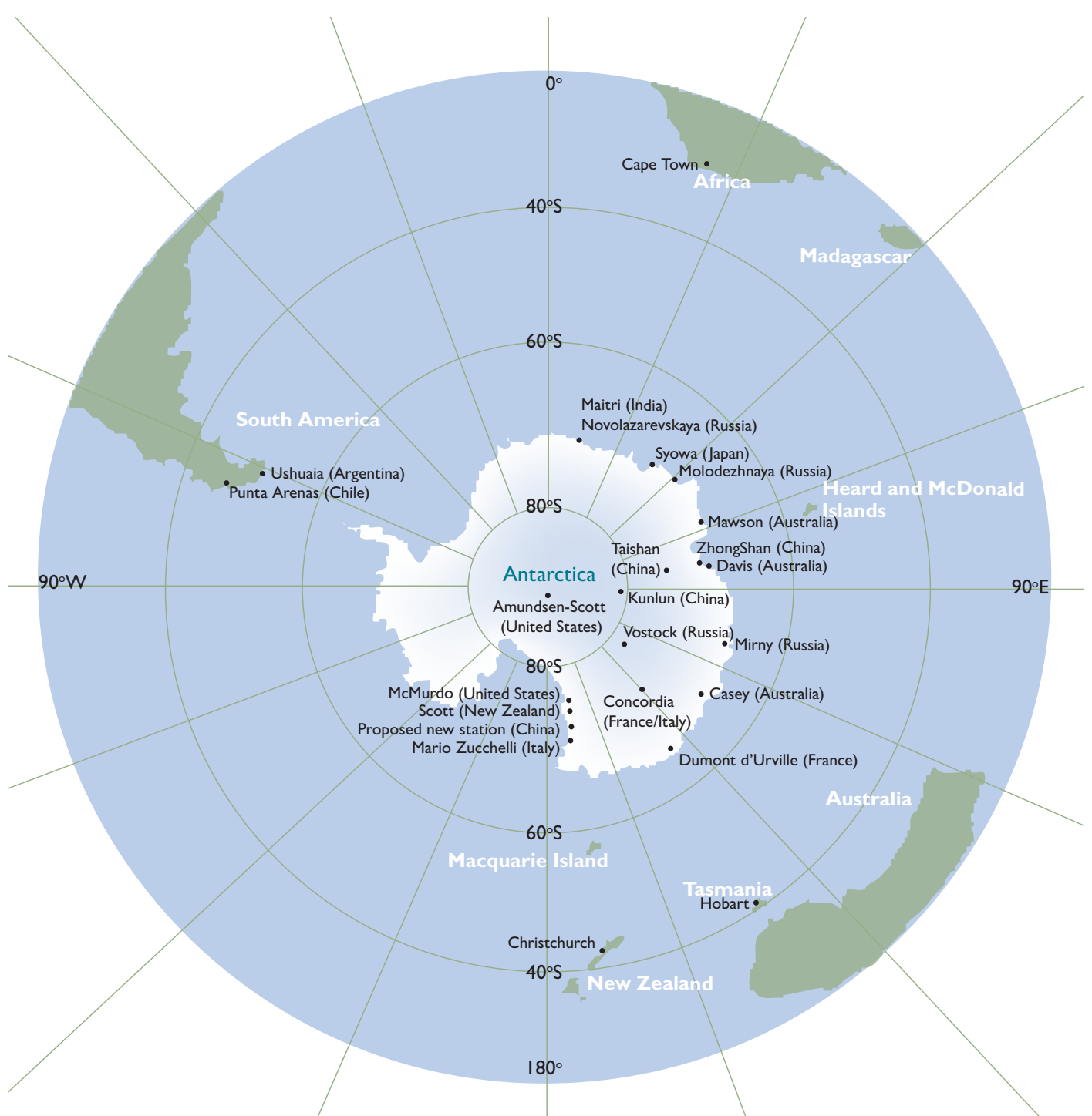
Stations on the Antarctic Continent in relation to Hobart.